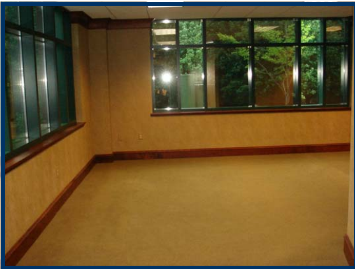
Entry Into Office