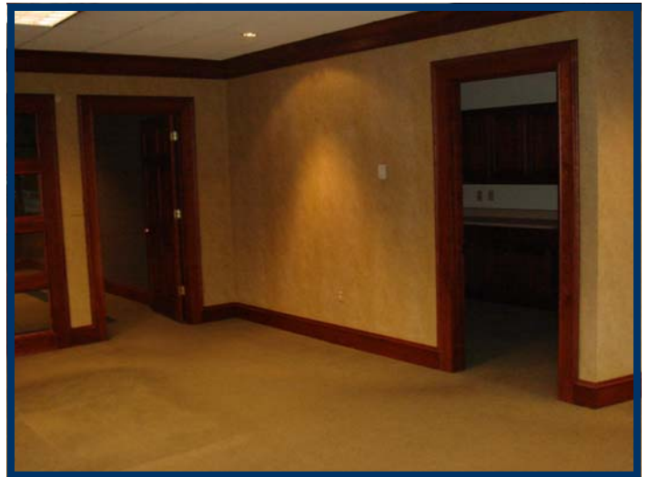
Potential Reception Area