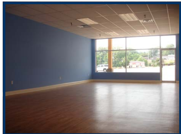
View of Interior Space